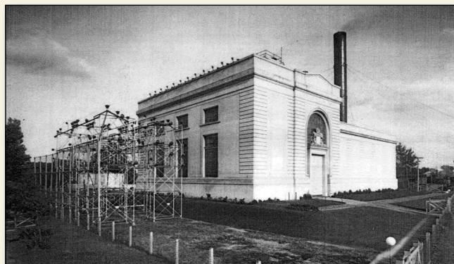
Historic River Station B, east of Sacramento, CA

A friend took me back to Folsom over a year ago, I hardly recognized the area, but the power plant is still there, they turned it into a museum. But, I couldn't find our old family farm, it's a housing development now. A word of advice, don't go back ... just remember it as it was.