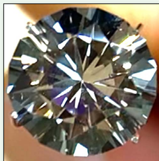
Great focus on detail with great outcomes!